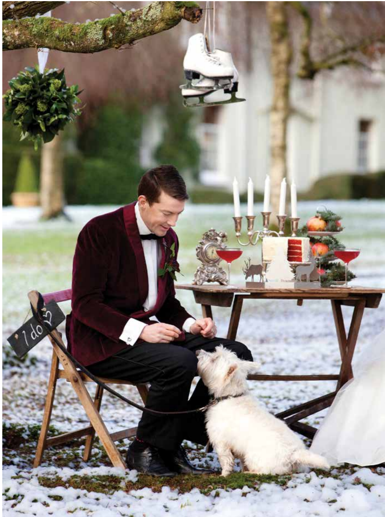
SETTING THE SCENE YEAR-ROUND.